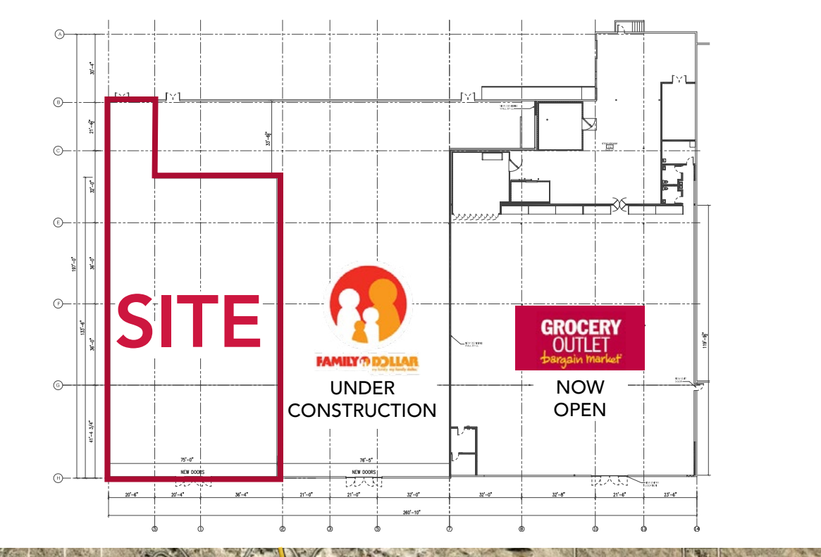
57252 Twentynine Palms Highway, Yucca Valley, CA 92284