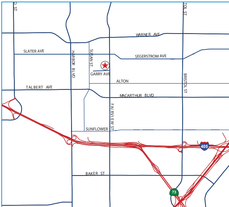
Thomas Guide Reference: 859-A1