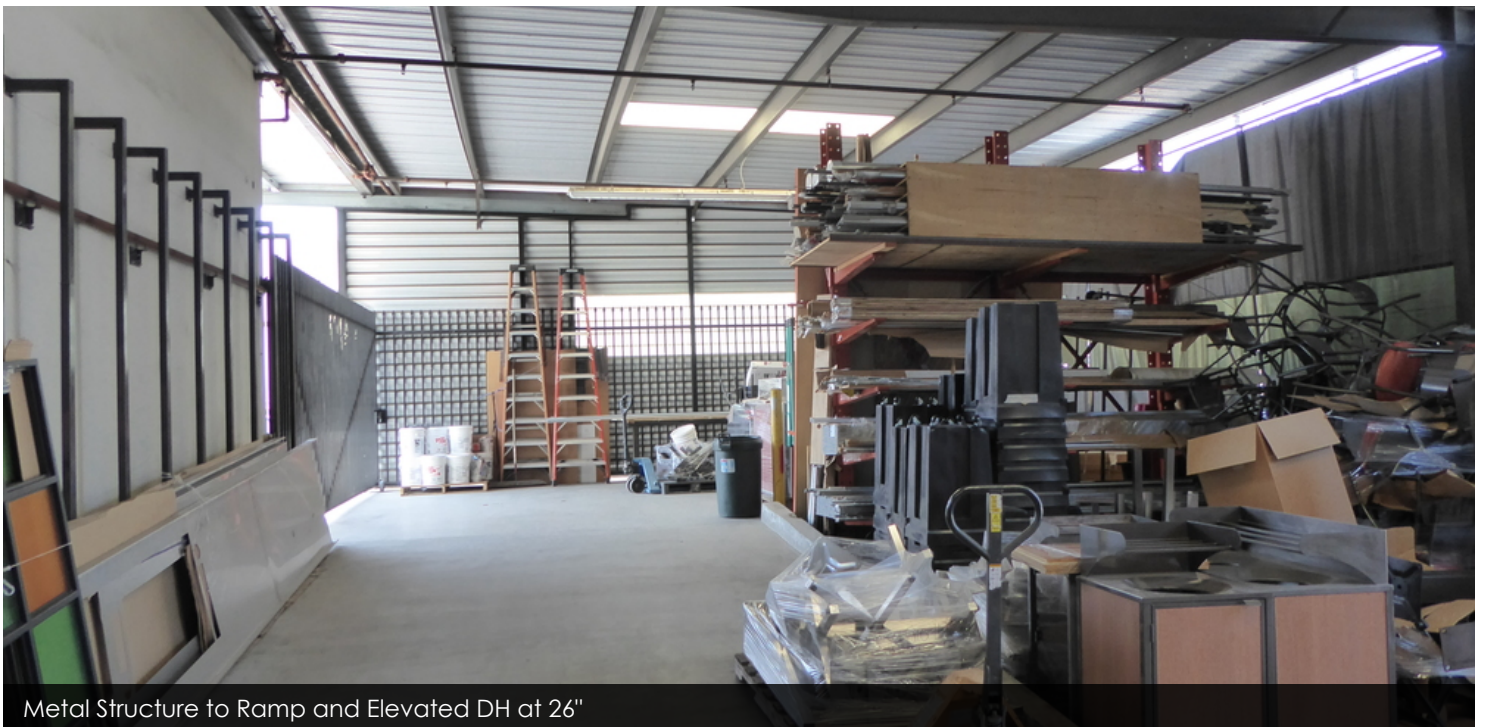
Metal Structure to Ramp and Elevated DH at 26"

Although all information is furnished regarding for sale, rental or financing is from sources deemed reliable, such information has not been verified and no express representation is made nor is any to be implied as to the accuracy thereof, and it is submitted subject to errors, omissions, changes of price, rental or other conditions, prior sale, lease or financing, or withdrawal without notice.