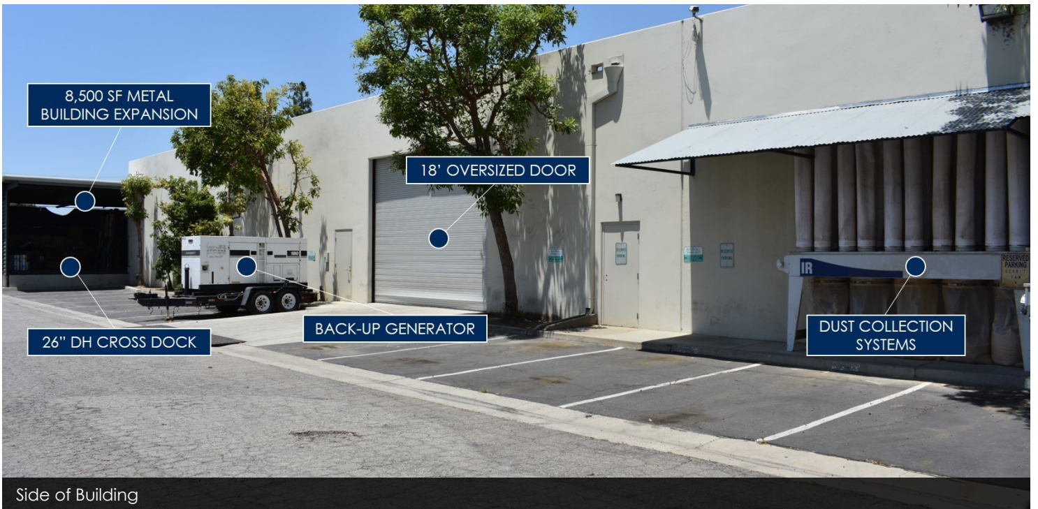
Side of Building

Although all information is furnished regarding for sale, rental or financing is from sources deemed reliable, such information has not been verified and no express representation is made nor is any to be implied as to the accuracy thereof, and it is submitted subject to errors, omissions, changes of price, rental or other conditions, prior sale, lease or financing, or withdrawal without notice.