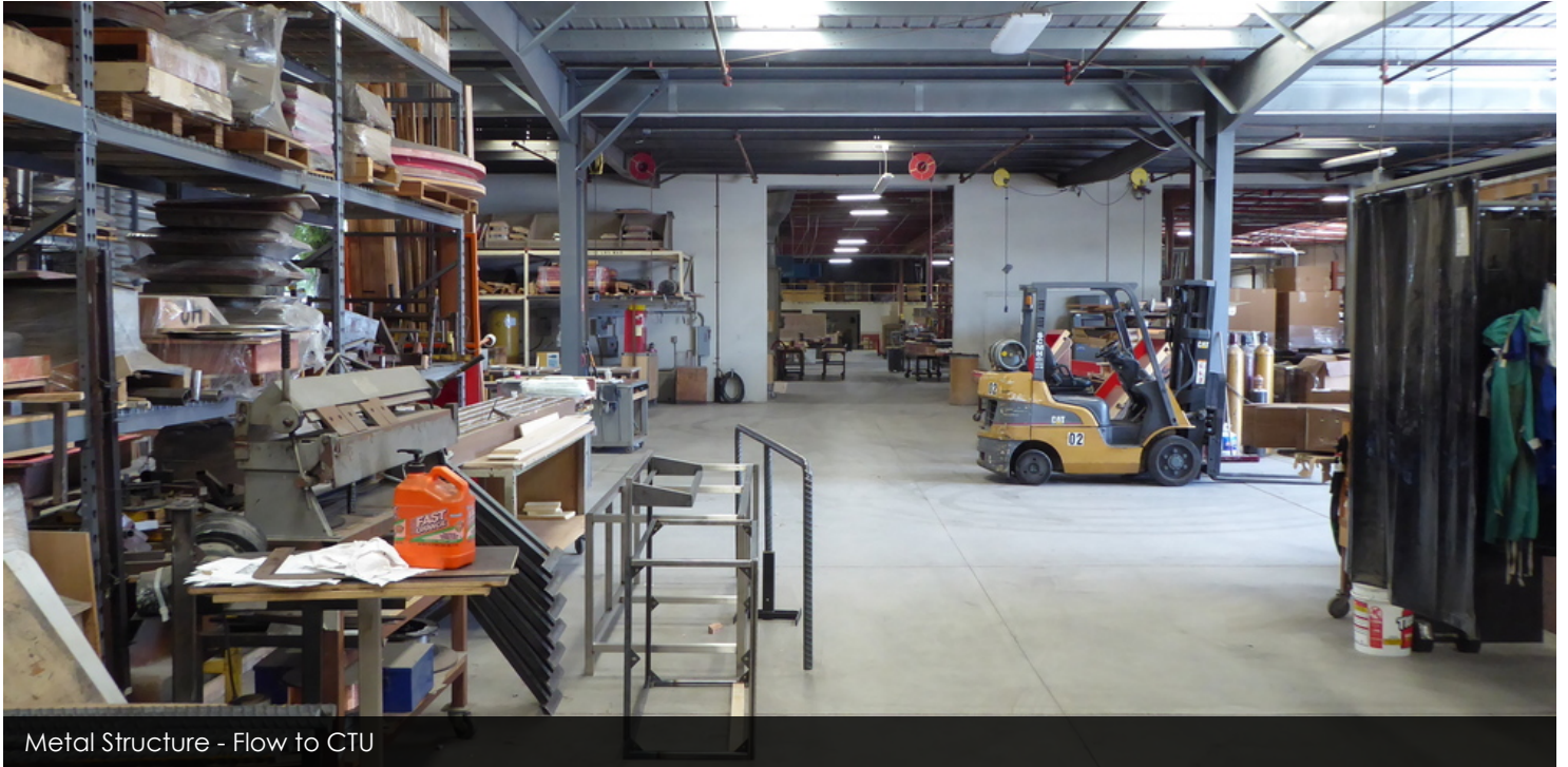
Metal Structure - Flow to CTU