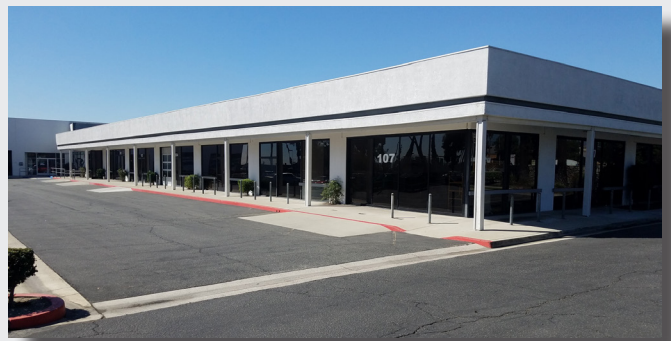
Property Photos - Unit 105