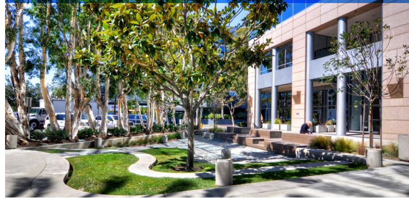
ON-SITE CONFERENCE CENTER IN BUILDING 7755