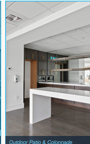
Outdoor Patio & Colonnade