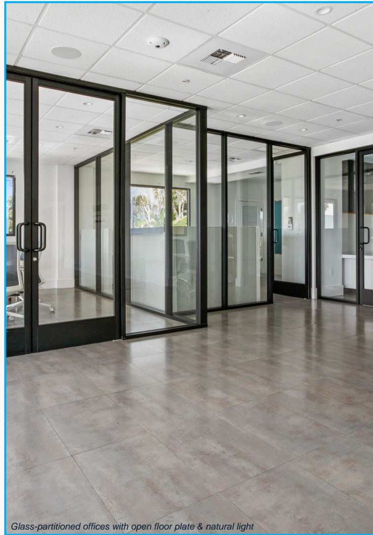
Glass-partitioned offices with open floor plate & natural light