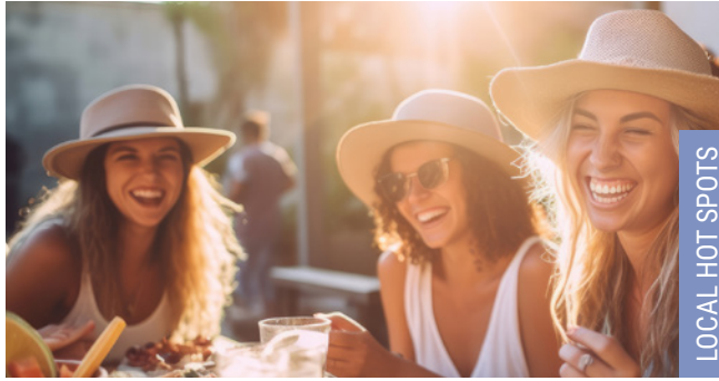
LOCAL HOT SPOTS

151 Kalmus Drive is situated in a commercial area known for housing a variety of businesses, from small startups to established companies, making it a bustling hub for commerce and industry.