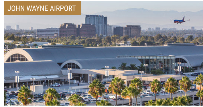
JOHN WAYNE AIRPORT