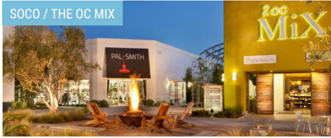
SOCO / THE OC MIX