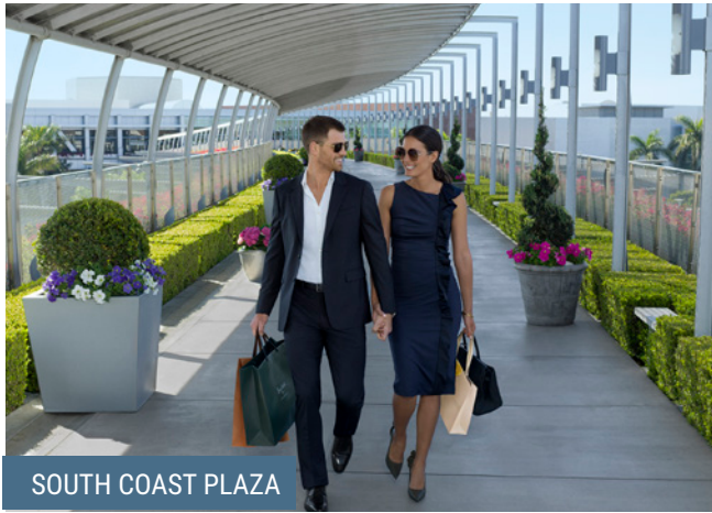
SOUTH COAST PLAZA